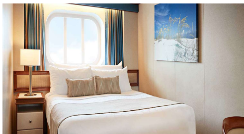
海景房 Oceanview 約 146 至 206 sq. ft.