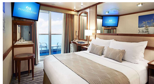
露台房 Balcony 約 214 至 222 sq. ft.