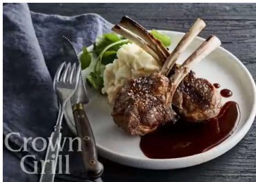
Crown Grill · 曾被評為最佳遊輪牛排館